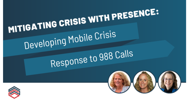
Navigating Crisis: Key Insights From SAMHSA's GAINS Center's "Mitigating Crisis With Presence" Webinar