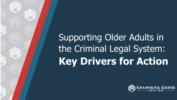
Supporting Older Adults in the Criminal Legal System: Key Drivers for Action