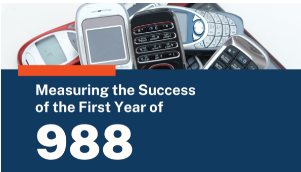
Measuring the Success of the First Year of 988