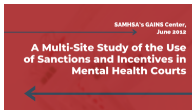
A Multi-Site Study of the Use of Sanctions and Incentives in Mental Health Courts | June 2012