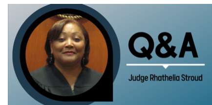
Q&A with Judge Rhathelia Stroud | December 2020