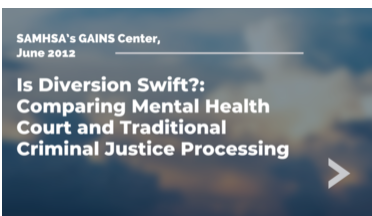
Is Diversion Swift?: Comparing Mental Health Court and Traditional Criminal Justice Processing | June 2012