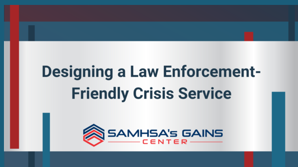
Designing a Law Enforcement-Friendly Crisis Service | April 2020