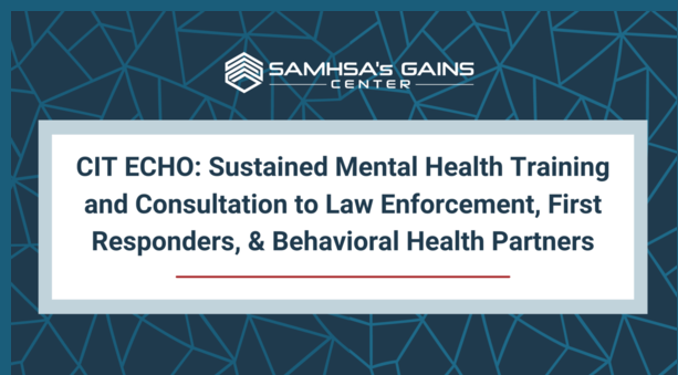
CIT ECHO: Sustained Mental Health Training and Consultation to Law Enforcement, First Responders, & Behavioral Health Partners