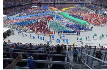
Choose to Include: Special Olympics 2022