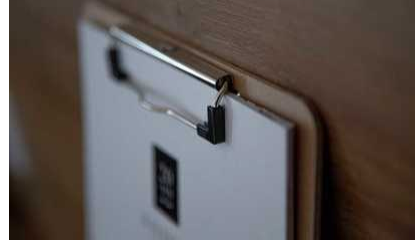
Day of Service: Point in Time