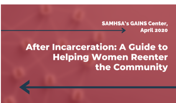
After Incarceration: A Guide to Helping Women Reenter the Community | April 2020