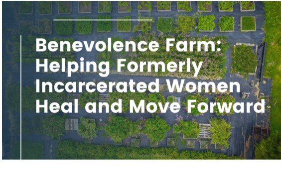
Benevolence Farm: Helping Formerly Incarcerated Women Heal and Move Forward | July 2022