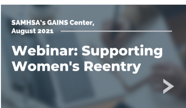
GAINS Webinar: Supporting Women's Reentry | August 2021